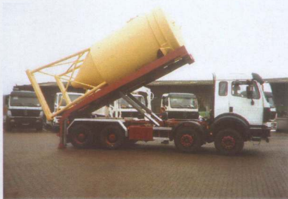
Placing device for 2-pocket-silos