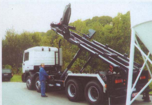
COMBILIFT for NORMANN BOCK silos and 2-pocket-silos