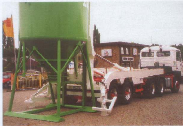
Semi-trailer silo lift for 2-pocket silos and NORMANN BOCK silos