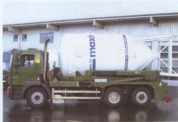
DELTA PRO skipping loader for NORMANN BOCK silos and 2-pocket-silos